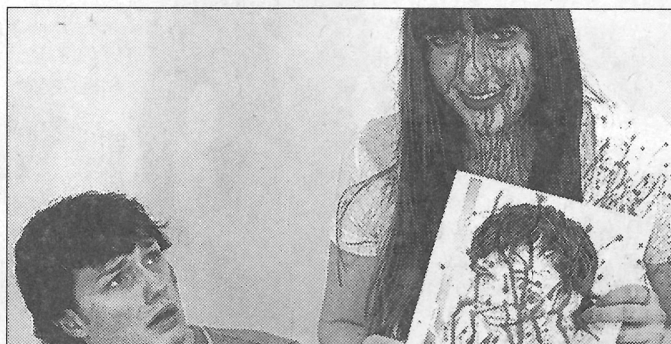
“Teenage Misery: A Horror Musical”